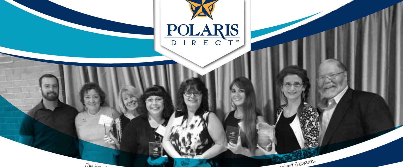
The Polaris Direct team at the 2017 NEDMA Awards for Creative Excellence where we received 5 awards.